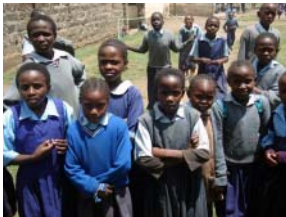
JAMII Elementary School Children

Uniforms/Shoes/Clothing Daily Meals School Supplies Field Trip & Extracurricular Activity Fees Medical Coverage