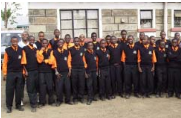
JAMII High School Boys

Tuition/Room/Board/Meals Books/Supplies Uniforms/Shoes/Additional Clothing Personal Hygiene Necessities Field Trip & Extracurricular Activity Fees Medical Coverage.