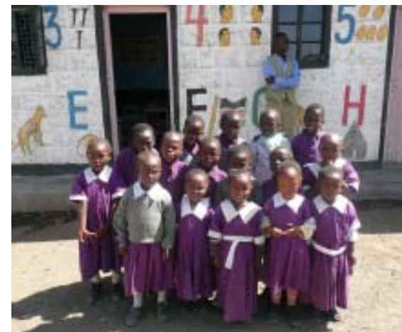
JAMII Kindergarten & Pre-School Children

Uniforms/Shoes/Clothing Daily Meals School Supplies Field Trip & Extracurricular Activity Fees Medical Coverage JAMII Teacher's Salary & Teaching Aids